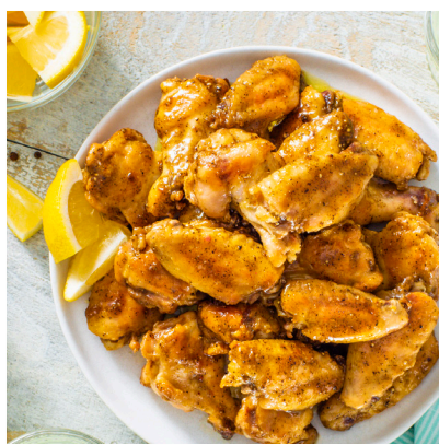
LEMON PEPPER WINGS