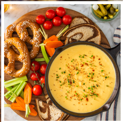
BAVARIAN BEER CHEESE MOUSSE DIP

with these delicious menu ideas from Dr. Oetker Professional