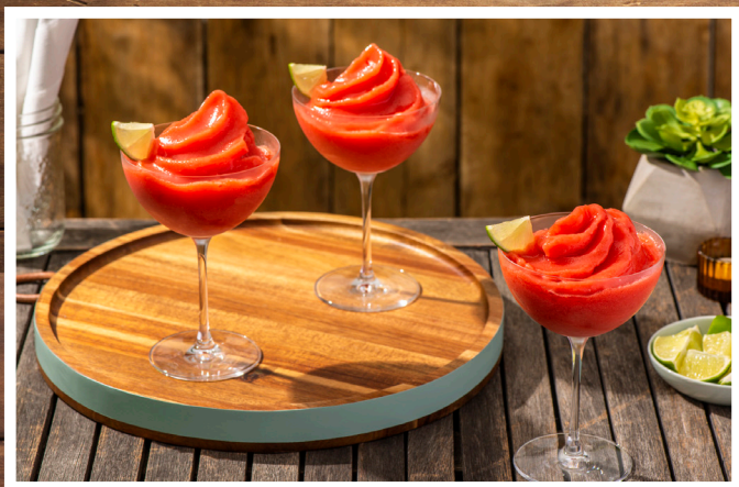
STRAWBERRY FROSÉ MARGARITA