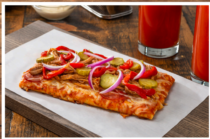
PULLED PORK CUBAN PIZZA

Visit us at www.oetker-professional.ca for these easy to prepare patio dining recipes and product information!